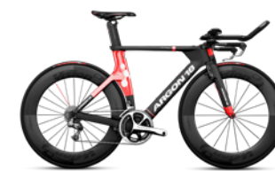
BLACK MATTE / RED GLOSS

The next level, the one most others can only dream of. This is where the E-118 Next will take you. When it comes to time trial, every detail counts and the bike is a crucial. The E-118 Next is our flagship TT bike, it has been designed to shave off every second possible. The E-118 Next is a lethal weapon; in the right hands, it will crush all competition.